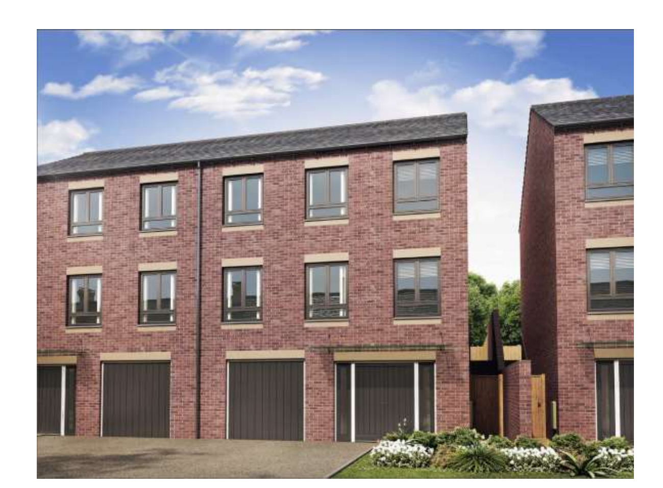
Type G 3 bedroom home 1244 sqft