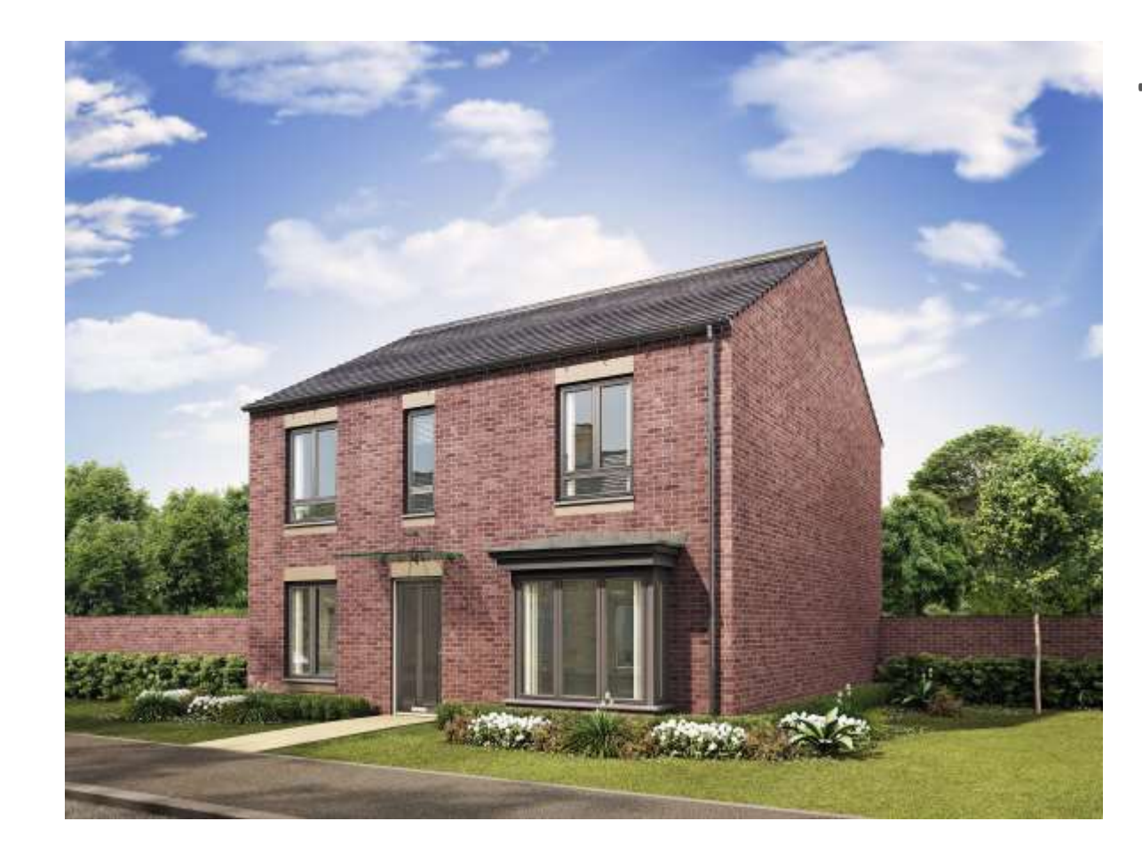
Type F 4 bedroom Home 1378 sqft