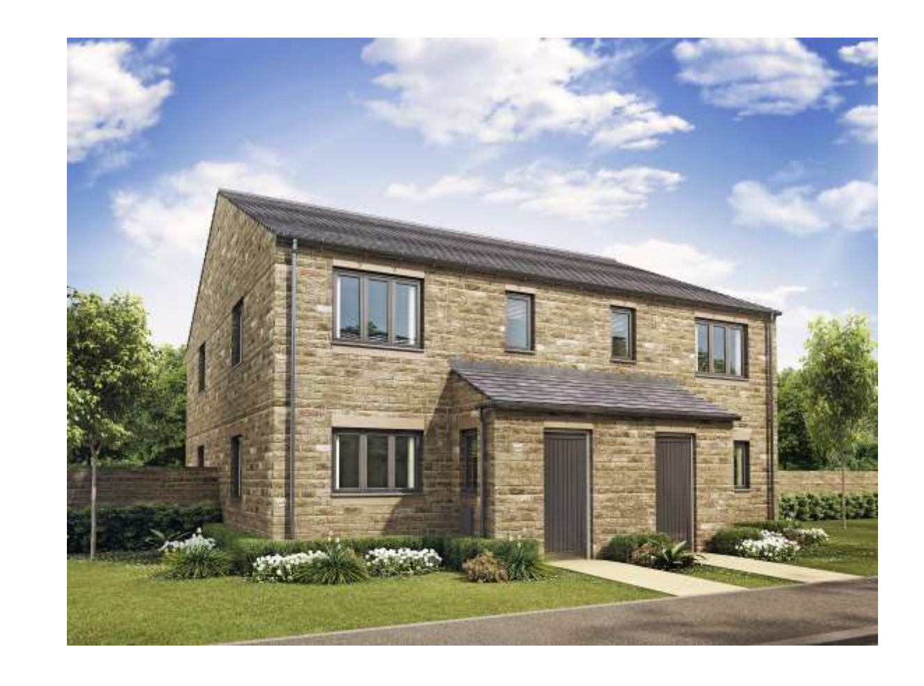
Type A 1 bedroom home 635 sqft