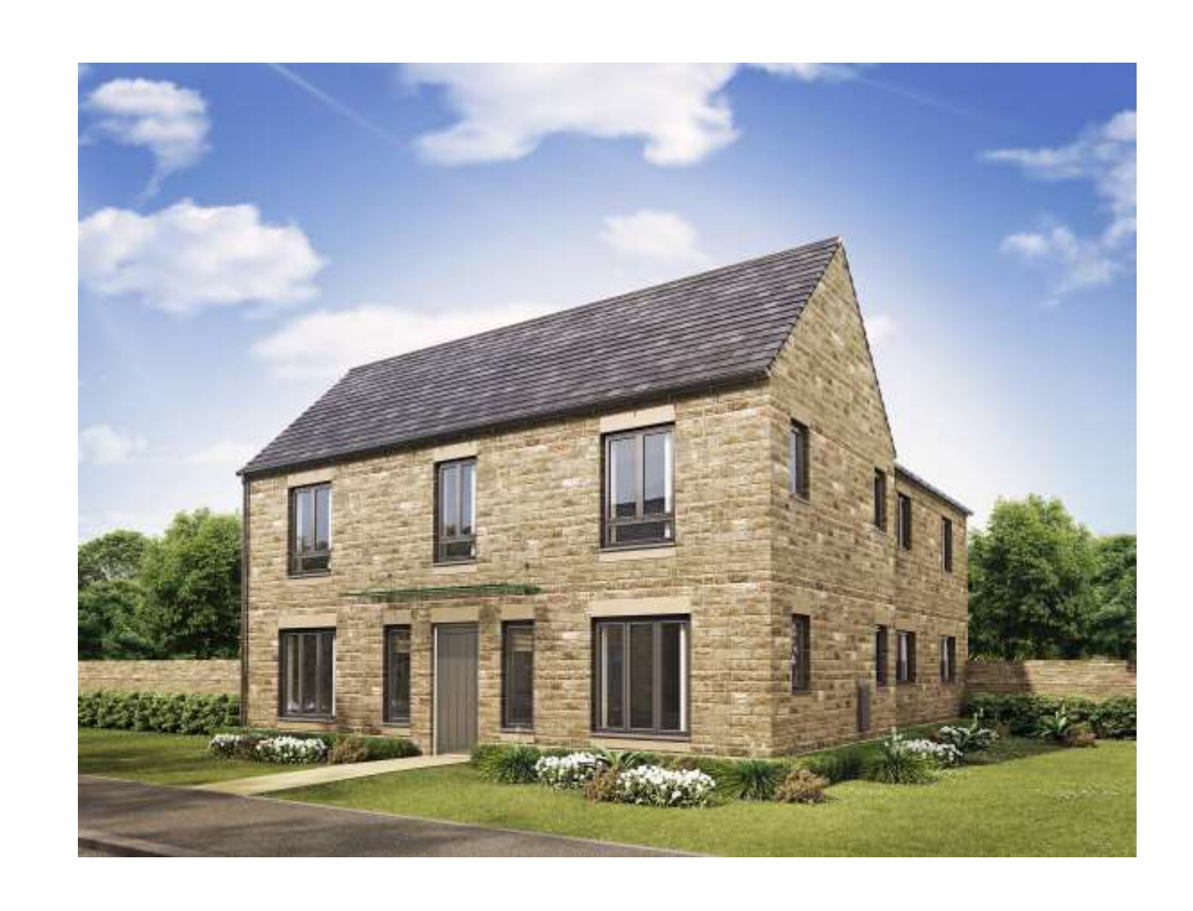
Type K 4 bedroom home 1530 sqft