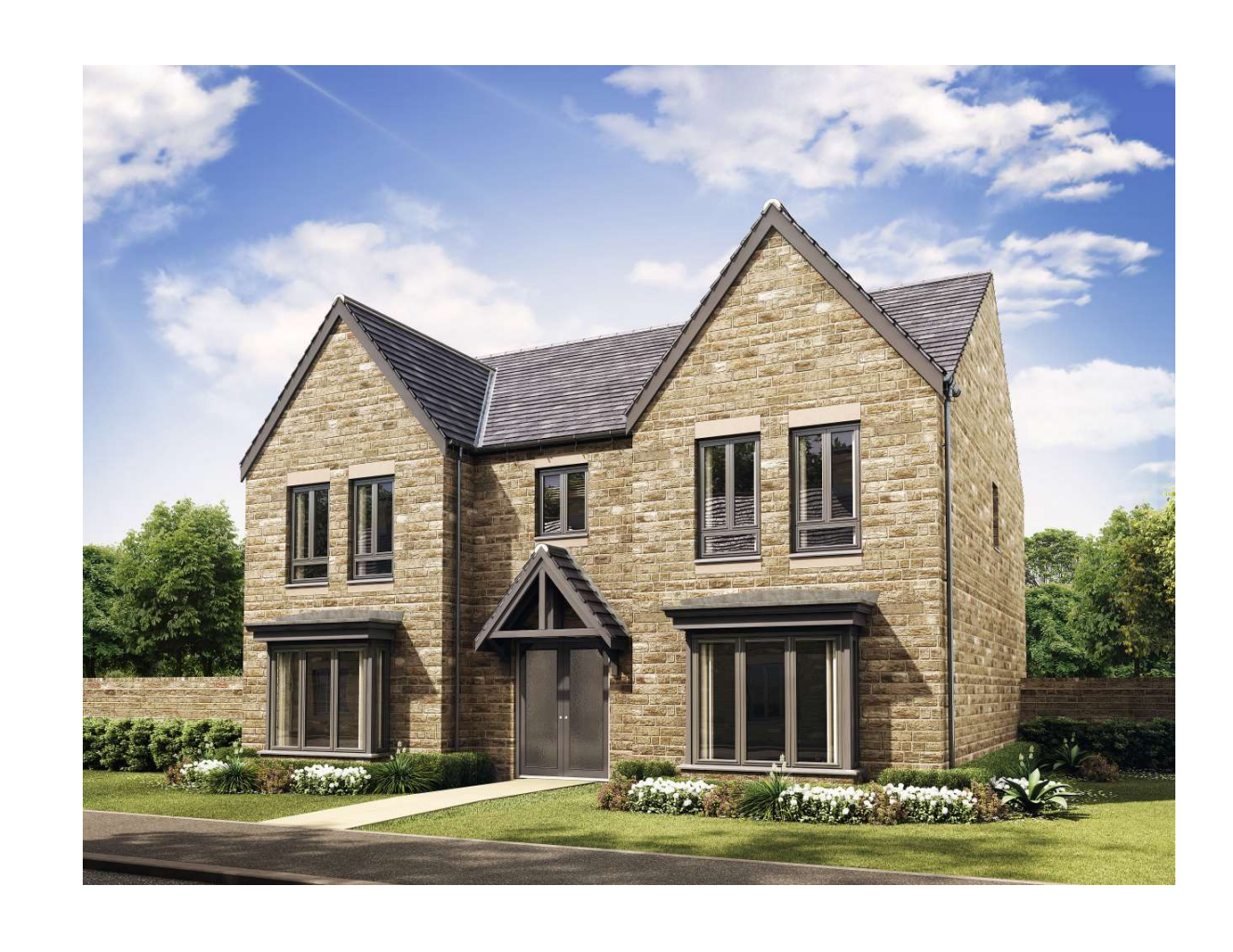
Type N 5 bedroom home 2006 sqft