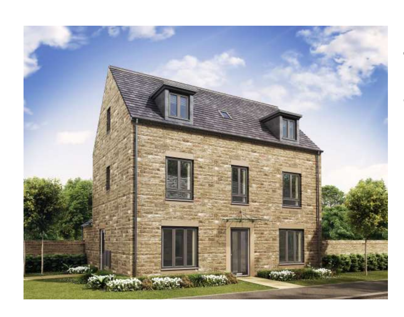
Type M 4 bedroom home 1773 sqft