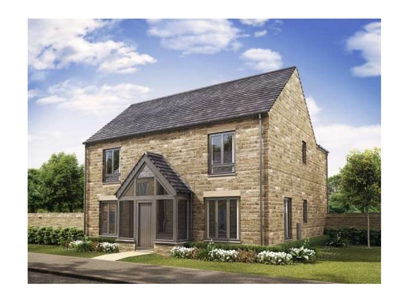
Type E 4 bedroom home 1330 sqft