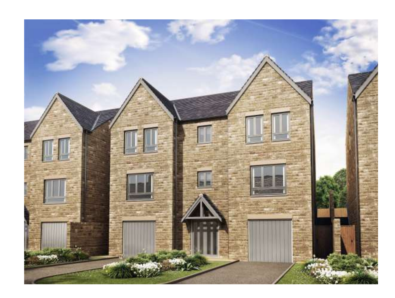
Type O 5 bedroom home 2006 sqft