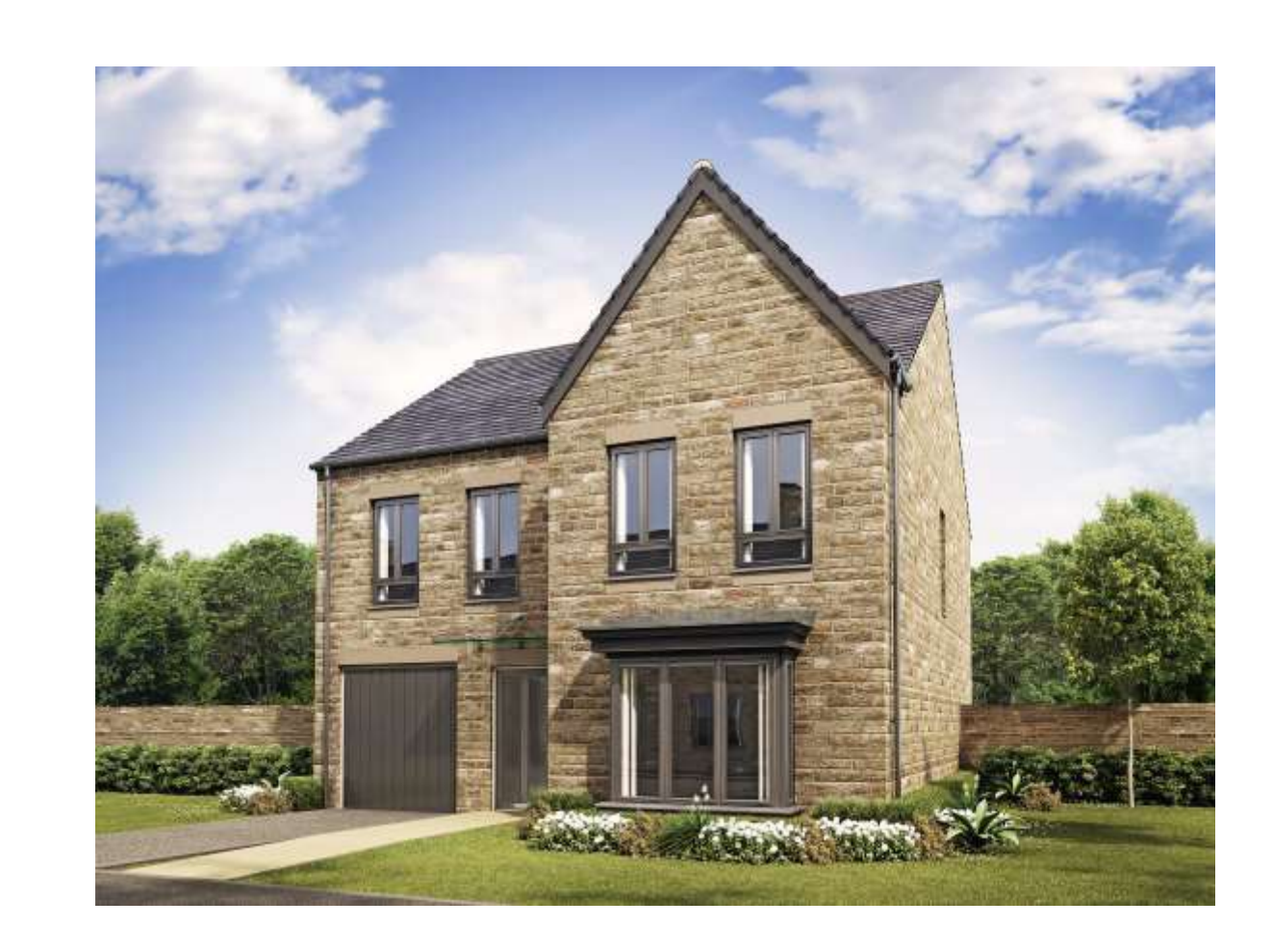
Type J 4 bedroom home 1460 sqft