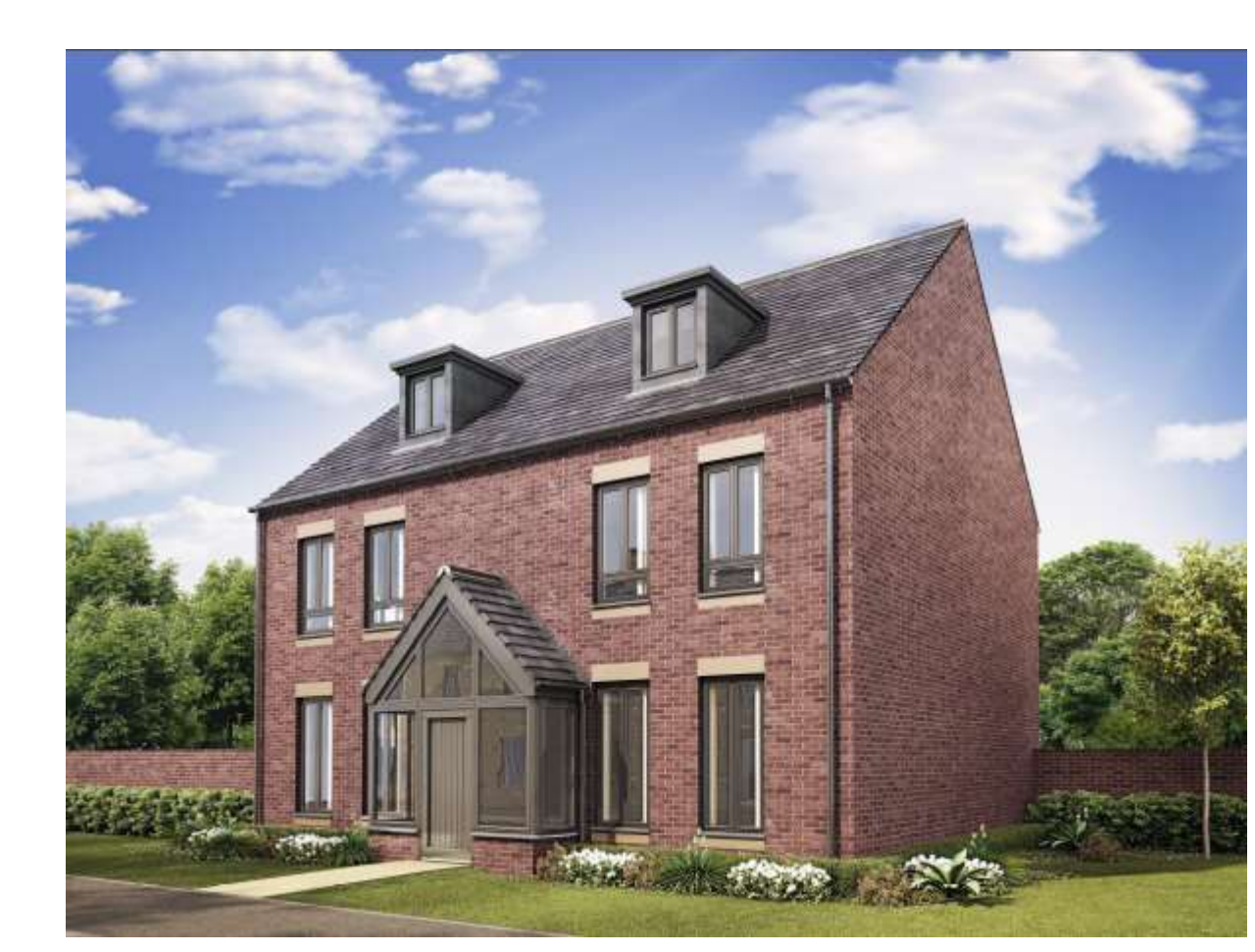
Type R (Brick)