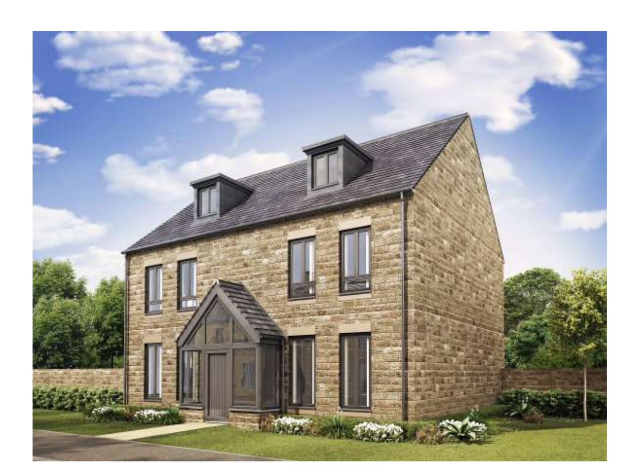
Type R (Stone) 5 bedroom home 2374 sqft