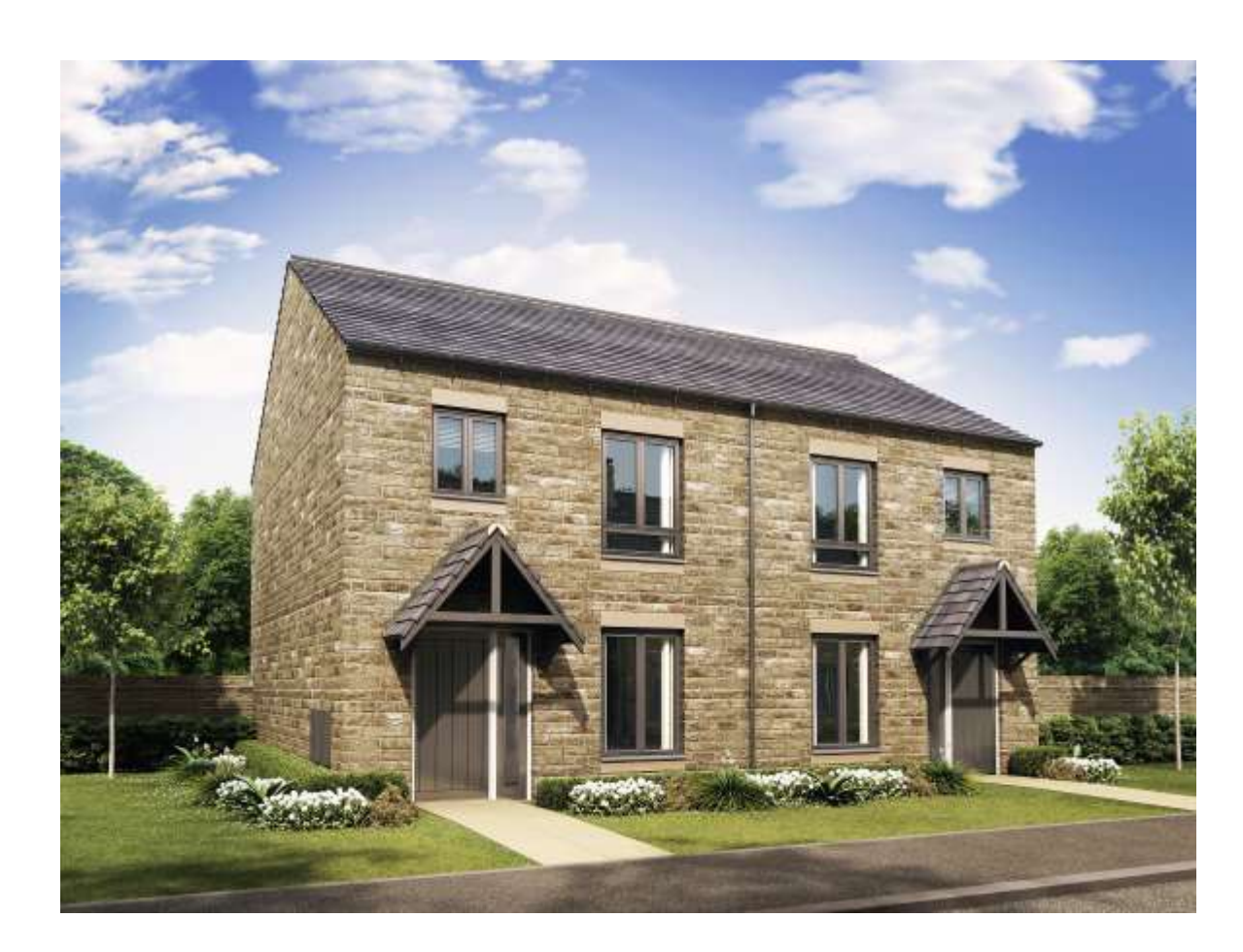
Type D 3 bedroom home 904 sqft